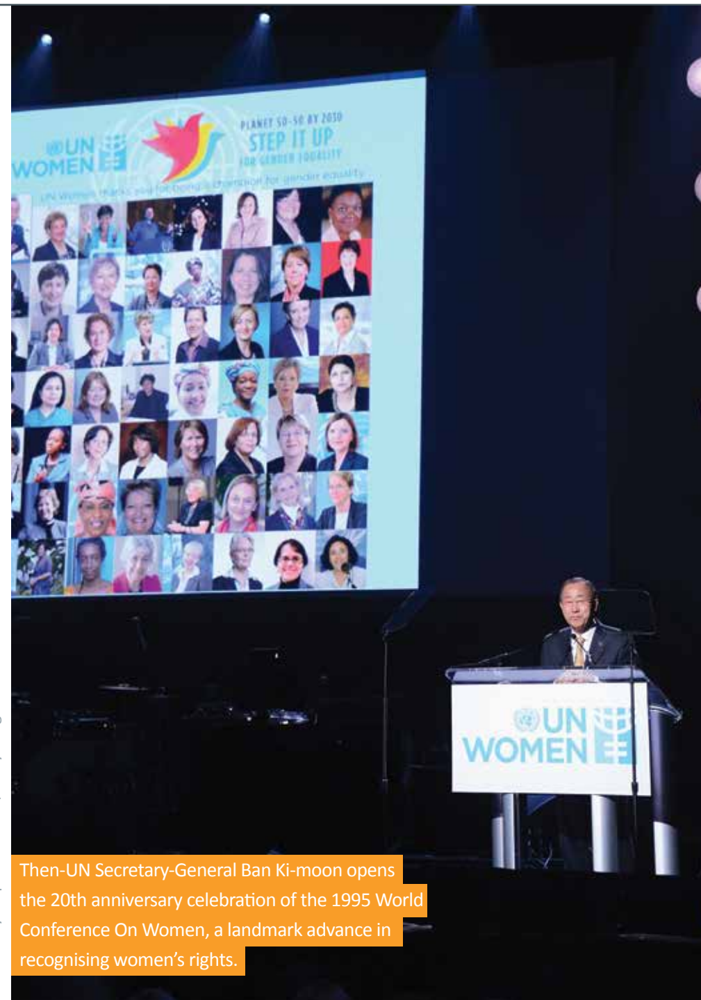
Then-UN Secretary-General Ban Ki-moon opens the 20th anniversary celebration of the 1995 World Conference On Women, a landmark advance in recognising women's rights.