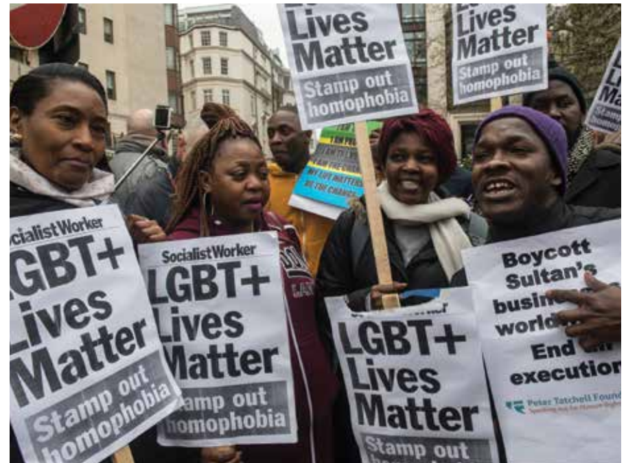
LGBTQI activists protest in London against the Sultan of Brunei, who ratified a law to make homosexuality punishable by stoning.

...try by all means to silence us and intimidate us using social media or direct messages... As a result, some of our human rights educators have abandoned the work because they fear for their lives.