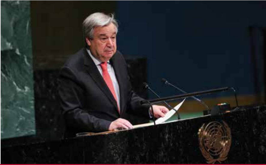
UN Secretary-General António Guterres speaks at the 2019 Commission on the Status of Women meeting.

The rise of anti-rights groups on the international stage is compounding longstanding and growing problems with international institutions, as described in previous State of Civil Society Reports. These include strategies by repressive states and leaders to constrain and weaken international institutions, including tactics of undermining, underfunding, blocking, vetoing and withdrawing, an increasing tilt of international institutions towards the private sector, and working practices that are characterised by hierarchy, bureaucracy and caution. Into an international system that is already stretched, under attack and under-resourced, and is trying to do more with less, anti-rights groups are posing a growing challenge that international institutions simply do not have the capacity to manage, causing them to become more cautious and conservative as a result. At the same time the danger is that if international institutions tighten their rules to exclude more anti-