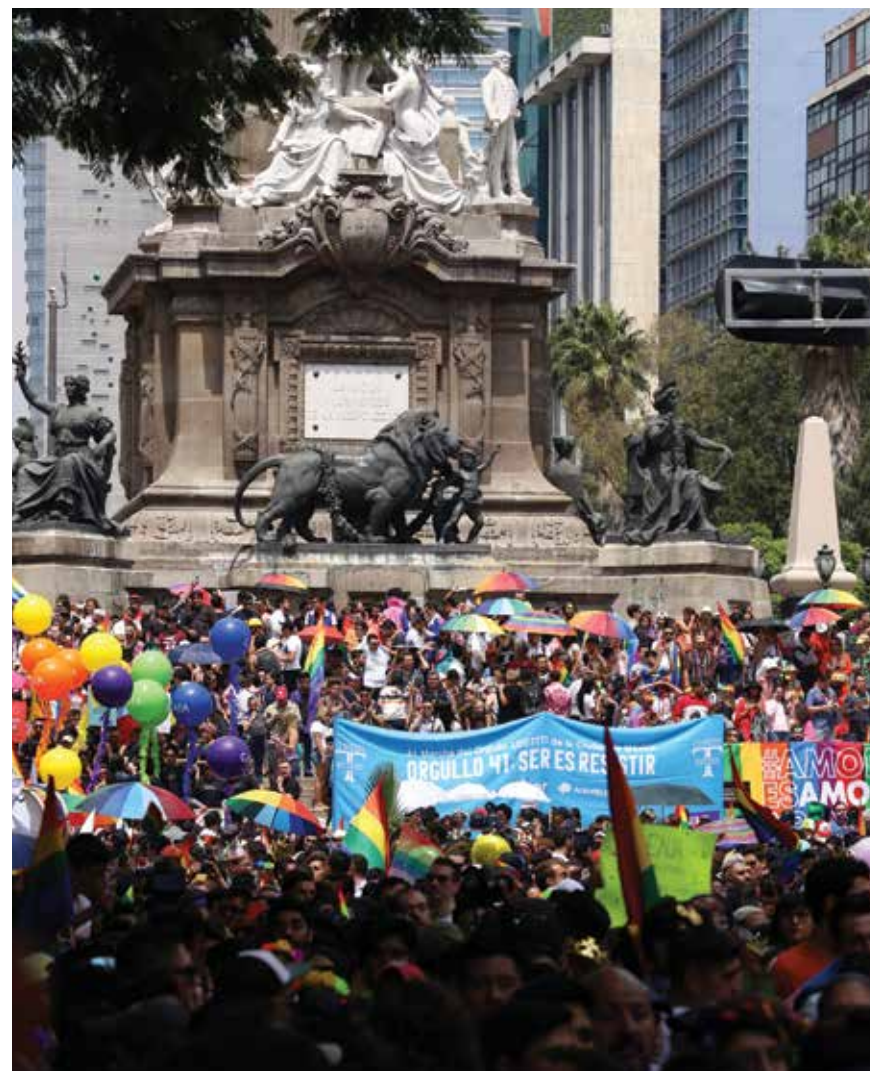
A Gay Pride parade and concert was held on 29 June 2019 in Mexico City.

With regard to street actions, strong reactions by these groups were already recorded in the past, including demonstrations