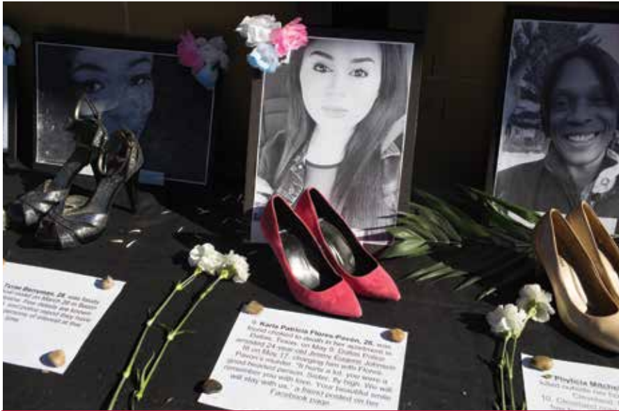
A memorial in New York, USA, honours the Latin American transgender people who have fled discrimination and violence in their countries only to end up murdered in the USA.

Sometimes states or ruling parties use anti-rights groups as a proxy to enact violence. Thang Nguyen of Boat People SOS relates how in Vietnam, the one-party state instrumentalises non-state groups to mobilise violence as a supplement to its onslaught against religious minorities: