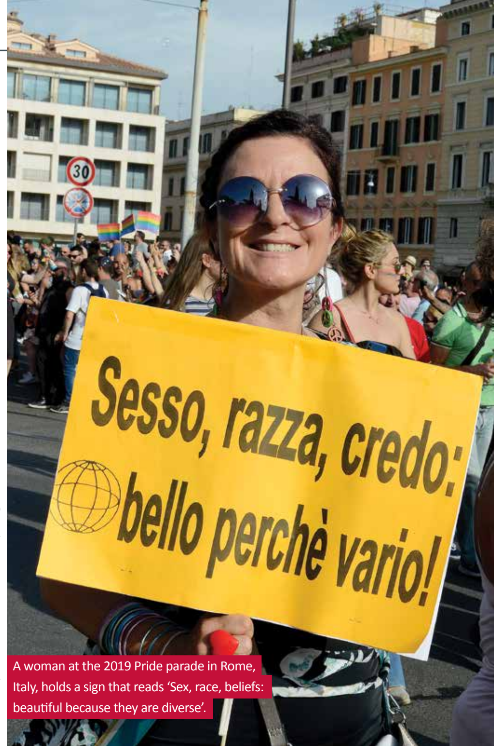
A woman at the 2019 Pride parade in Rome, Italy, holds a sign that reads 'Sex, race, beliefs: beautiful because they are diverse'.