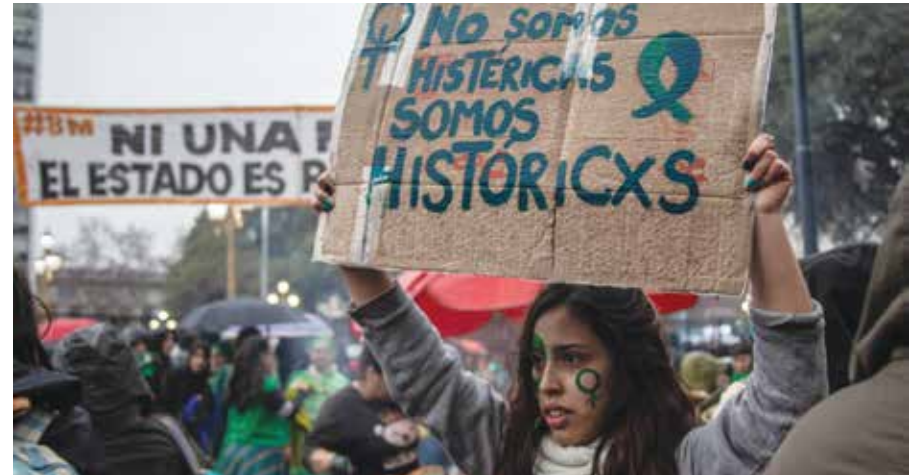
Demonstrators march in Buenos Aires, Argentina, on the eve of a decisive congressional vote on abortion rights in August 2018.

...people find it difficult to differentiate between our organisations and theirs.