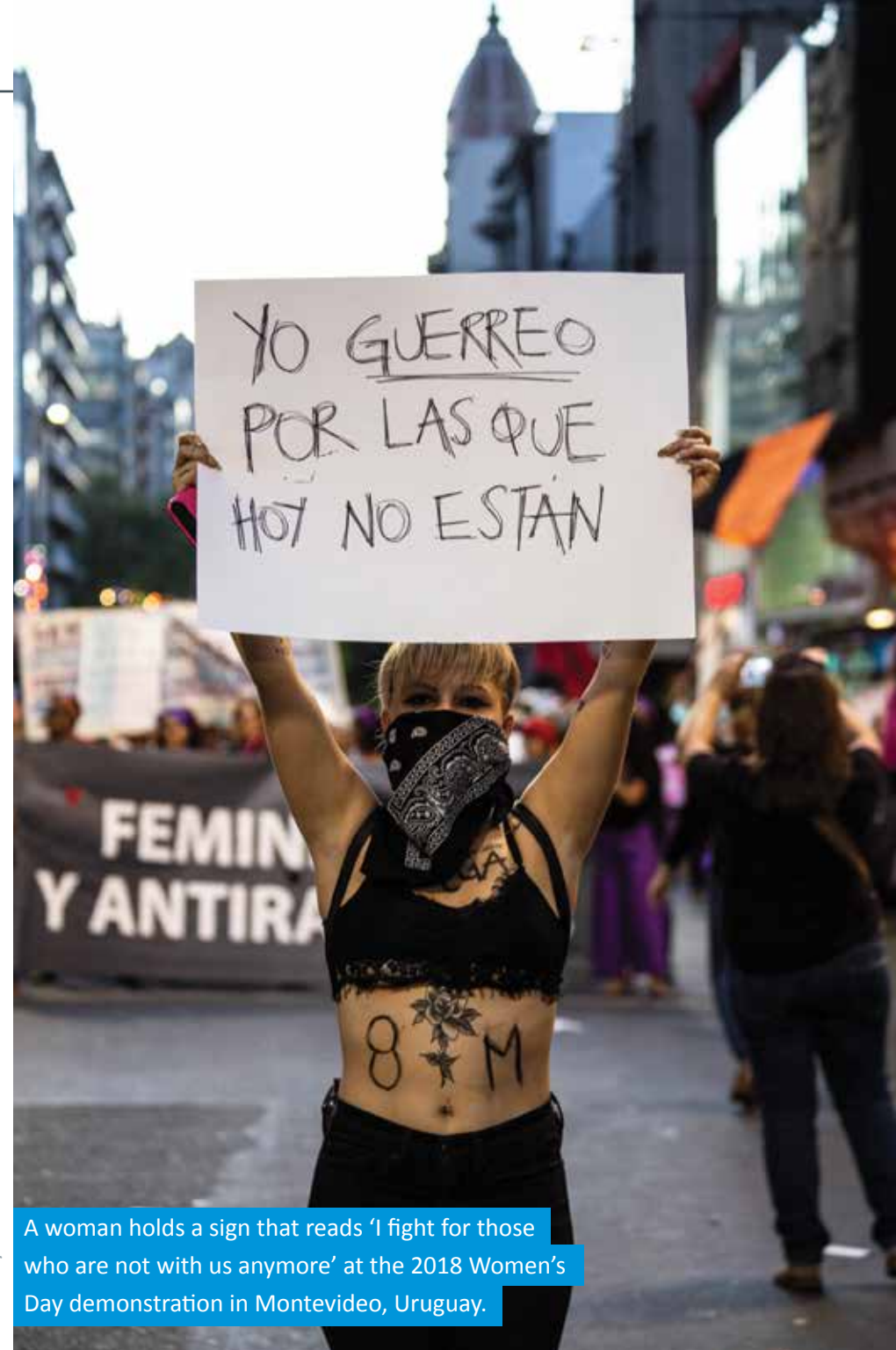
A woman holds a sign that reads 'I fight for those who are not with us anymore' at the 2018 Women's Day demonstration in Montevideo, Uruguay.