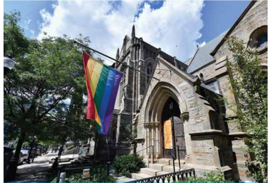
Churches that welcome LGBTQI people, such as the Emmanuel Church in Boston, Massachusetts, USA, could be allies.

There are feminist and LGBTQI movements that work from the standpoint of religious pluralism, disputing the idea of the monopoly of faith, and these are very rich spaces of struggle and