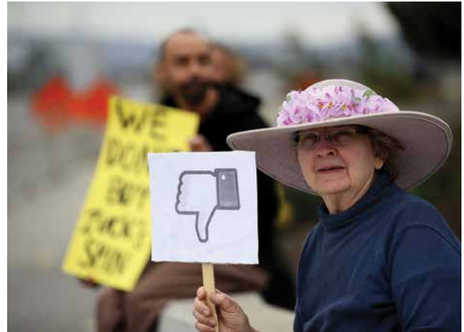
The Raging Grannies group demonstrates outside Facebook headquarters in California, USA in April 2018.

More is now understood, following the Cambridge Analytica scandal and other such revelations, about how social media messages are carefully