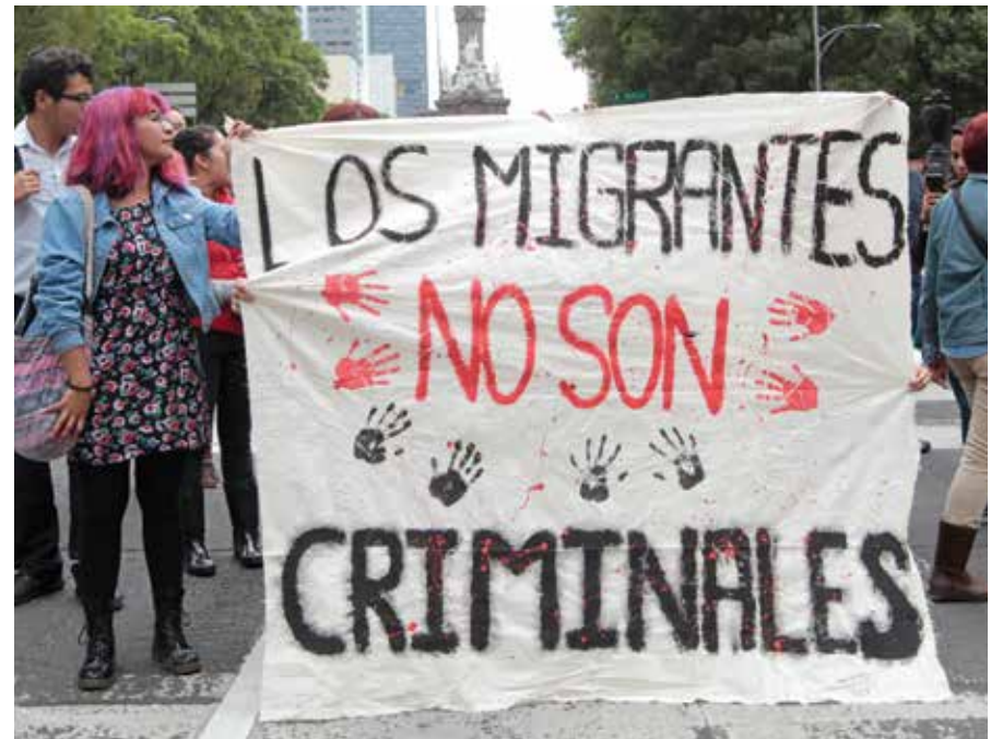
People demonstrate outside the US Embassy in Mexico City to protest against President Trump’s measures that target migrant families.

Attacks on excluded groups are not only ideological; they are also tactical. By attacking excluded groups, anti-rights groups weaken opponents and recruit and consolidate support from the core constituencies they seek to appeal to.