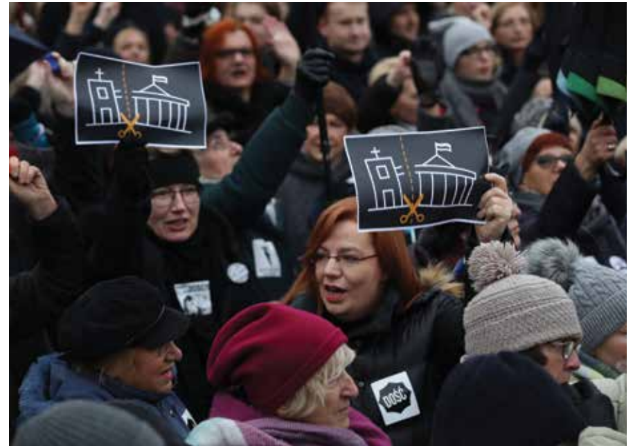
Protesters in Poznan, Poland demand church-state separation during a 2018 rally against a proposal to further restrict abortion.

Using the long-established language of rights can play as part of a disinformation strategy because it muddies the waters of public discourse and dilutes our language of rights. It also helps anti-rights groups obtain access to domestic and international dialogue spaces and, potentially, funding opportunities.