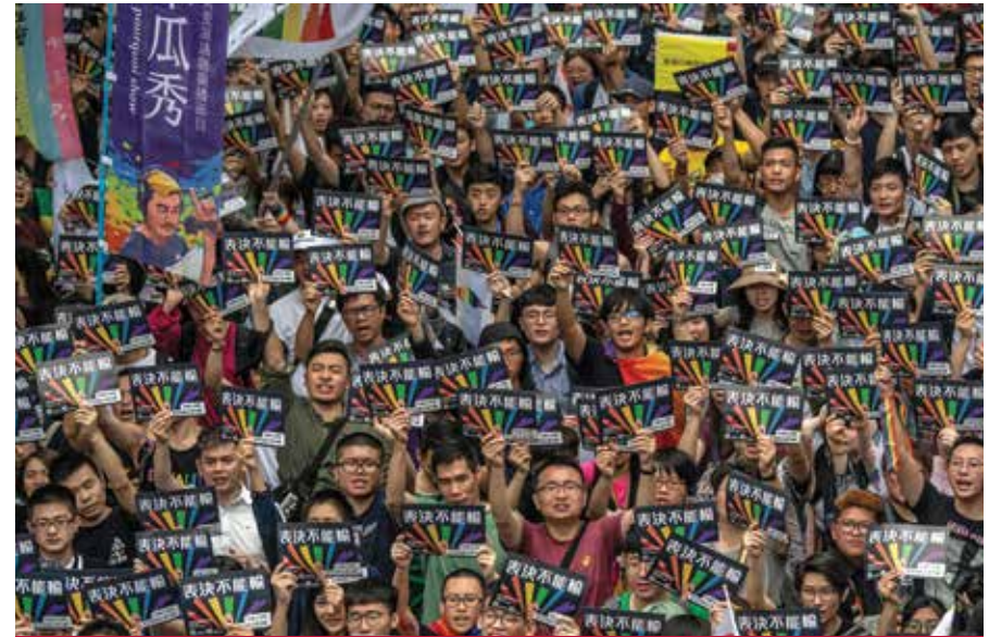
People celebrate in May 2019 as Taiwan becomes the first Asian country to legalise same-sex marriage.

Another tactic that uses legitimate channels sees anti-rights groups going to the courts and using litigation to reduce access to rights. Even if unsuccessful, these tactics absorb civil society energies, stoke fears and play to anti-rights narratives, as Gordan Bosanac describes: