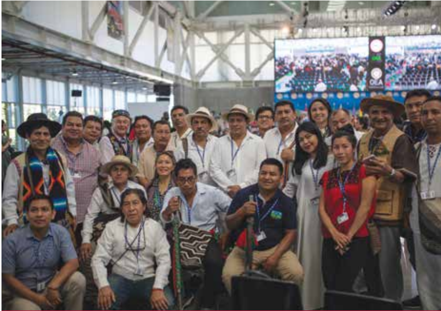
Members of the Indigenous Peoples of America at the opening session of the 49th OAS General Assembly in Medellín, Colombia, 2019.