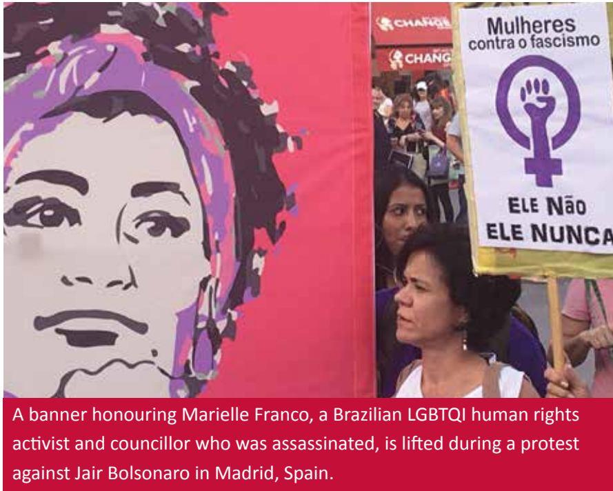
A banner honouring Marielle Franco, a Brazilian LGBTQI human rights activist and councillor who was assassinated, is lifted during a protest against Jair Bolsonaro in Madrid, Spain.