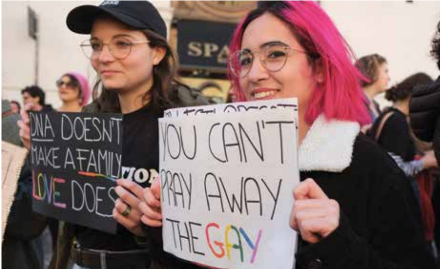
Members of the feminist movement Non Una di Meno (“Not one less”) demonstrate outside the Italian Parliament against the World Congress of Families held in Verona, Italy.

LGBTQI community, against women and against migrants. They share the same philosophy.