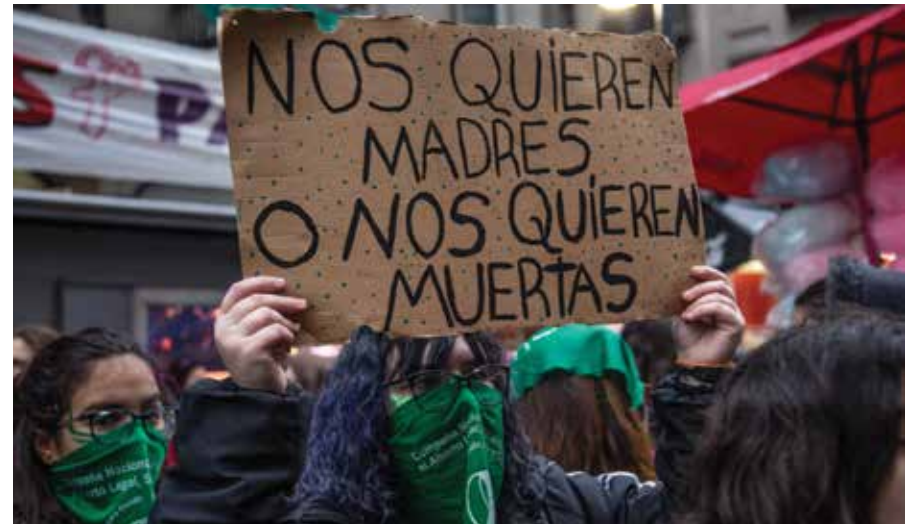
A young woman holds a sign reading ‘They want us mothers or dead’ during a mobilisation for abortion rights in Buenos Aires, Argentina.

As this suggests, the ‘gender ideology’ terminology is further deployed against the assertion of LGBTQI rights, and particularly trans rights. Only rigid, unchanging heterosexual orientations are deemed acceptable. Advances won through committed civil society advocacy, such as same-sex marriage and laws that recognise the identities of trans people, have been met with backlash and characterised as granting privileges to undeserving minorities rather than efforts to ensure that rights are truly universal. The recognition of same-sex marriage and the identities of trans people are red lines: marriage can only be between a man and a woman and trans people are positioned as imposters. A relatively innocent matter such as equal access to washrooms has become a fiercely contested flashpoint.